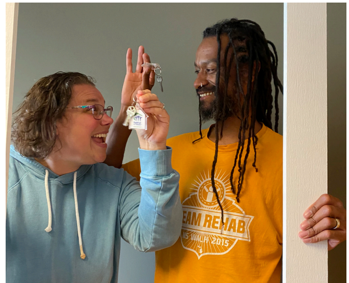
The Hogans Family moved into their new Habitat home in May 2022

67% of our Habitat homebuyers are single female head of household