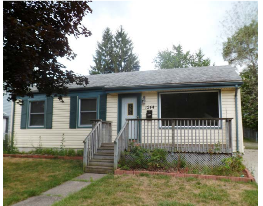
Their future home at 1244 Lester